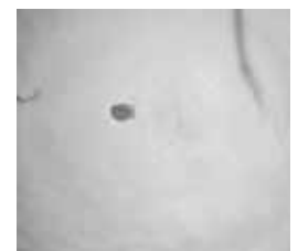
Fig. 3. Image of the harvested organoid.